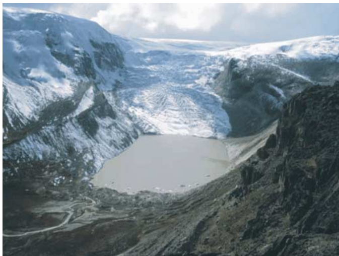
Figure 3 | Changes in the Qori Kalis Glacier, Quelccaya Ice Cap, Peru, between 1978 (a) and 2002 (b). Glacier retreat during this time was 1,100 m (L. Thompson, personal communication).